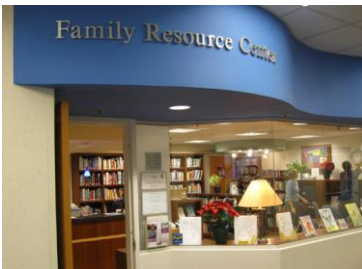
Family Resource Center St. Louis Children's Hospital Third Floor, Room 3S-12 314-454-2350