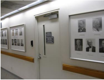
Rothschild Medical Library 1st Floor, Steinberg Building 314-454-7208