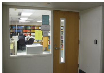
St. Louis Children's Hospital Medical Library Third Floor, Suite 3N-34 314-454-2768